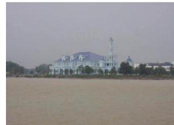
Haze shuts Muar schools