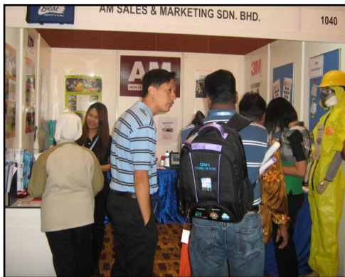
AM SALES staffs in the midst of handling enquiries from safety officers/ users.